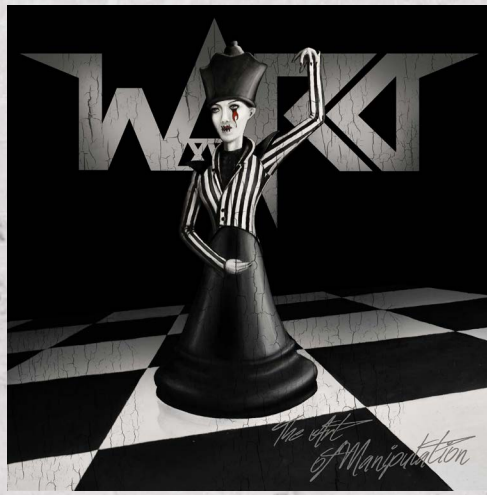
Debut album: The Art of Manipulation (2017)

Drawing from their eclectic background, Ward XVI are inspired by a whole host of musical masters, including Alice Cooper, Iron Maiden, Rob Zombie, Diablo Swing Orchestra, Avatar and Marilyn Manson.