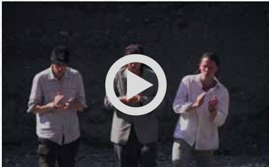
Lose Your Ties Official Music Video