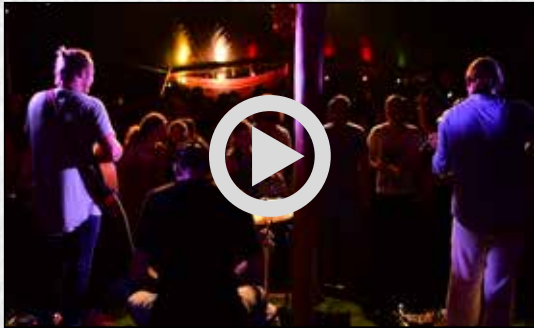
The Trouble Notes Lose Your Ties Live at Festsaal Kreuzberg