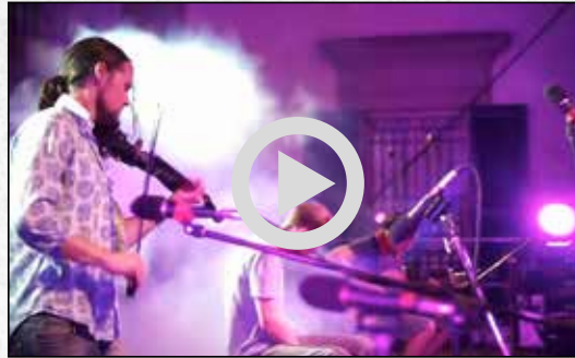
The Trouble Notes - highlight reel