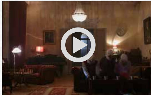
Grand Masquerade Official Music Video