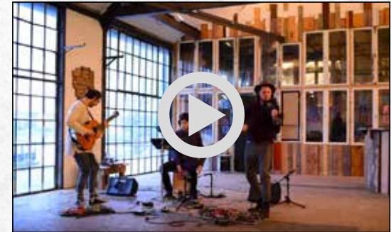
The Trouble Notes - Grand Masquerade Live Performance - Kaos Berlin