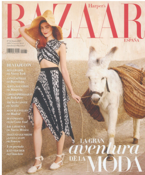
HARPER'S BAZAAR, Editorial and interview.