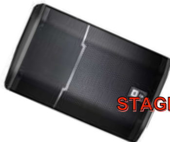
STAGE MONITORS 1 + 2