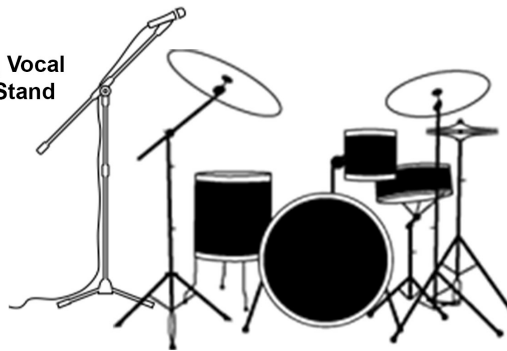
Backing Vocal Boom Stand