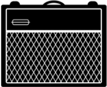
Guitar Amp ( Mic )