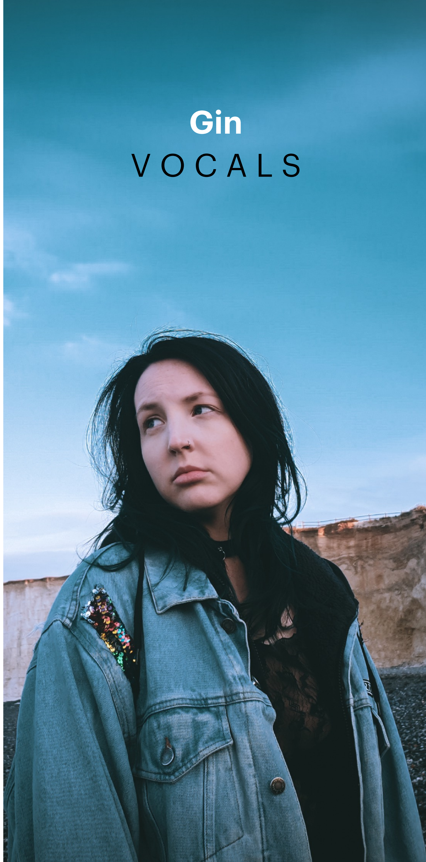
Gin V O C A L S